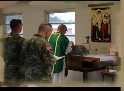
Care for the Wounded