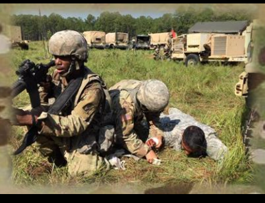
Honor the Dead