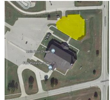
North Parking Lot Highlighted

I understand that this is combined Protestant and Catholic Chapel sponsored RSO event, and agree to abide by the rules and decisions made by the Trunk or Treat Committee.