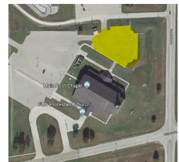
North Parking Lot Highlighted