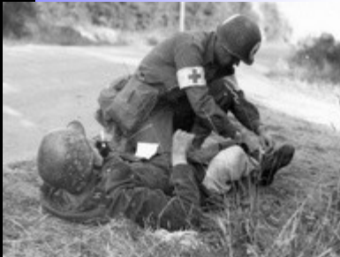
US Medic Treating an SS Soldier

Which of these 2 criteria do you control?