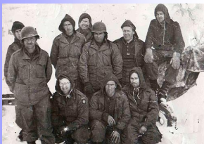
319th GFAR Paratroopers Battle of the Bulge

SELFLESS SERVICE: Put the welfare of the Nation, the Army, and your subordinates before your own.