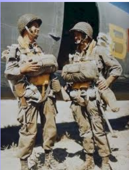
82nd Paratroopers (WWII)

DUTY: Fulfill your obligations...The essence of duty is acting in the absence of orders or direction from others, based on an inner sense of what is morally and professionally right.