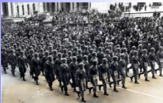
82nd Represented All Armed Forces in NY Victory Parade