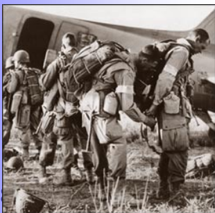
Recipient PVT 82nd Jumpers JMPI for Normandy Jump

INTEGRITY: Do what is right, legally and morally. Be willing to do what is right even when no one is looking. It is our "moral compass."