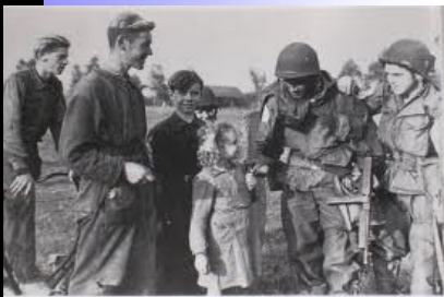
82nd Caring for the Dutch People in WWII